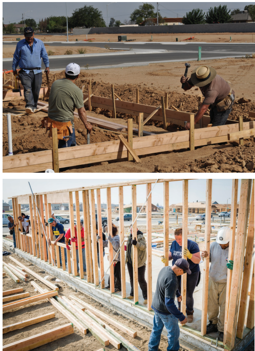
Families Building Homes: Participant families hard at work on their new homes in Goshen.