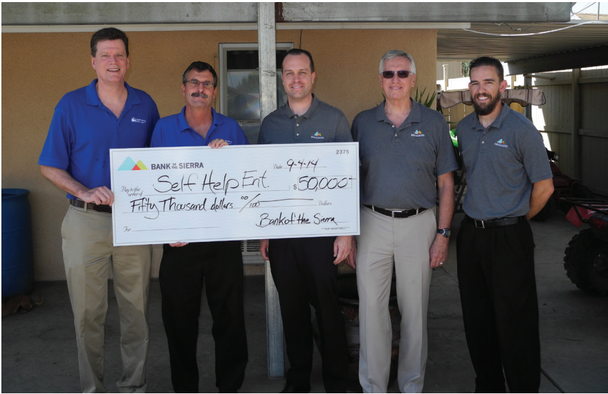
Right. Bank of the Sierra presents $50,000 to Self-Help Enterprises for drought relief efforts.

As we enter another dry year, Self-Help Enterprises is working to ensure more residents with dry wells receive this type of emergency assistance.