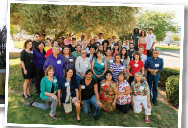
Above: Community Leadership Academy: SHE was proud to host the San Joaquin Valley Rural Community Leadership Institute. Participants acquired tools to become highly effective leaders in their communities.