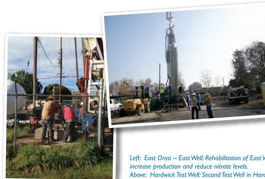
Left: East Orosi – East Well: Rehabilitation of East Well to increase production and reduce nitrate levels. Above: Hardwick Test Well: Second Test Well in Hardwick to locate potable water.

Small rural communities in the San Joaquin Valley often lack the most basic of services - clean drinking water and sanitary sewer systems. SHE's Community Development program works as a catalyst in seeking funding and technical assistance for communities developing water and wastewater systems and provides human resources and the technical assistance to these small towns to develop adequate water delivery and wastewater disposal systems.