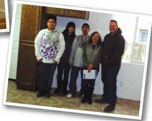
Top: Families in the new Goshen subdivision receive certificates before moving into their new homes.