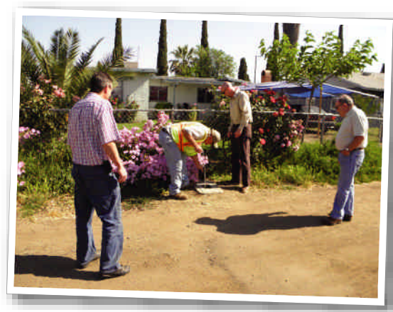
Construction (top) and final inspection (above) on the Fairways Tract connections.

We have become involved in numerous Integrated Regional Water Management planning areas and processes throughout the Valley, serving as an advocate for the needs of disadvantaged communities. These new activities and roles of CD staff, combined with traditional work in communities, have broadened the scope of CD efforts. One outcome of these efforts has been the formation of a local project team consisting of Provost & Pritchard, Community Water Center, Keller and Wegley, and SHE in a major contract offering by Tulare County to catalog problems and develop pilot studies for DAC water and wastewater projects in the Tulare Lake Basin, which includes the southern half of the San Joaquin Valley