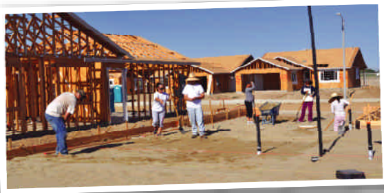
Participant families hard at work on their new homes in Goshen. Top Right: Families receive certificates of completion.

The mission of Self-Help Enterprises is to assist low-income residents of the San Joaquin Valley in improving their own living conditions. SHE's New Homes program works to fulfill this mission by designing modest, energy-efficient houses and guiding the future homeowners through the process of securing a mortgage loan and building their home. Working in groups of 8-12 families, these owner-builders complete approximately 70% of the work needed to complete the construction. By providing this labor, they reduce costs, build immediate "sweat" equity, and gain an important asset for the future security of their families. In working together, the new homeowners create a sense of accomplishment and neighborhood that has long-term benefits in their lives and in the fabric of their communities.