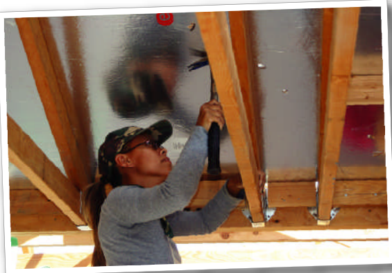
Participant families hard at work on their energy efficient homes in Tulare

Building “green” has also fostered some new and renewed partnerships for Self-Help Enterprises. CSET’s YouthBuild participants have been working alongside the Tulare homeowners-to-be throughout the construction process. In addition to the GRID Alternatives staff, members of the Proteus weatherization and solar-installation classes have joined the efforts in Tulare, as well as in Parksdale.