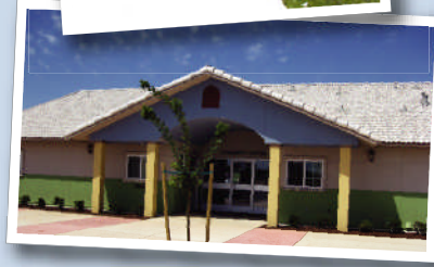
Above: New Homes - Page 2 Top Right: Rehab - Page 3 Bottom Right: Multifamily Housing - Page 4