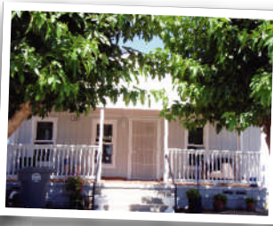
Left: Home Rehabilitation