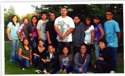
The Second Digital Connectors class of 15 Cutler-Orosi Students

The effort to bridge the digital divide in the Cutler-Orosi area is continuing through our partnership with One Economy. Digital Connectors are providing heightened community awareness of current technology, offering free internet access and making low cost computers available to area residents.