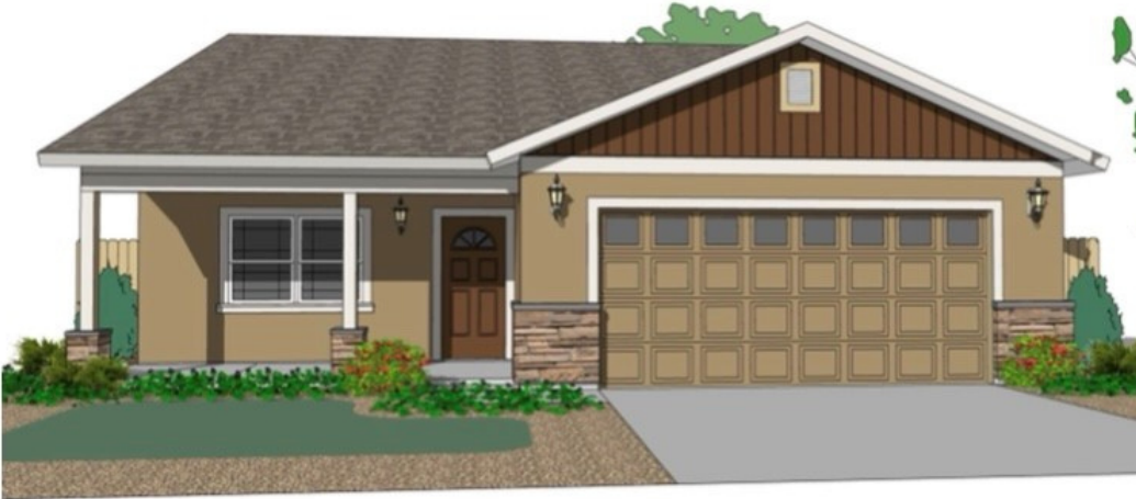
ELEVATION - C