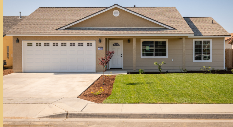
example of home