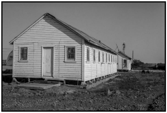
An abandoned labor camp in the delta.

Four blocks over from Walker Road, the census enumerators meet in the Itliong