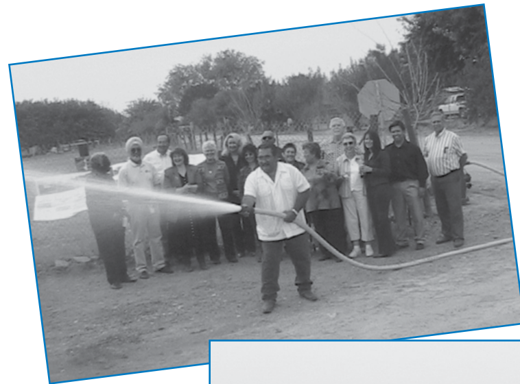
Alpaugh, Tulare County well installation for clean drinking water