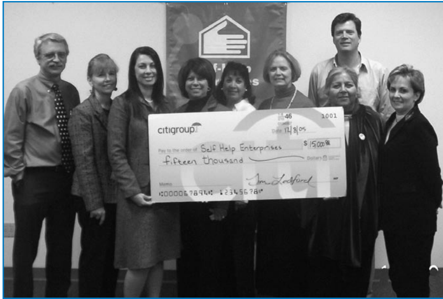
Citigroup Foundation provides a $15,000 grant for SHE's successful Homeownership Counseling program.